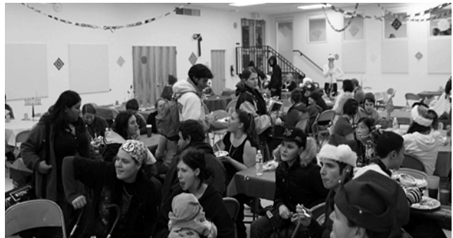
The 2006 Holiday Party

Each year, the U District providers team up to host The U District Homeless Youth Holiday Party. This December 12 th , youth will come for a hearty dinner, incredible dessert, entertainment by a live jazz trio, connection with volunteers and staff, and a present for every single young person under the tree. Each year, the holidays become a time of new support and giving for these young people .. maybe for the first time ever.