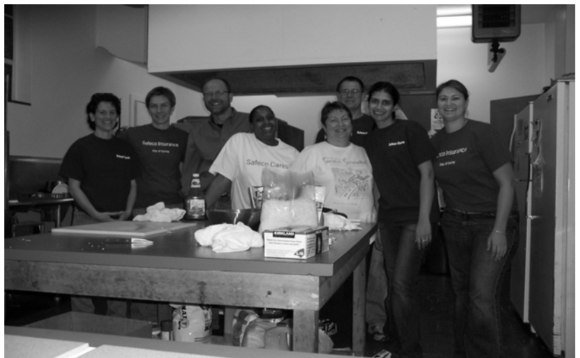
Members of the Safeco Insurance Meal Team on a recent Monday night.